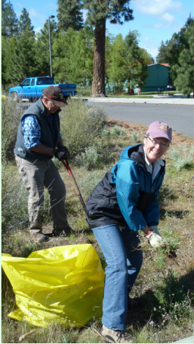
Participants in last year's Let's Pull Together event near Cascade Middle School.